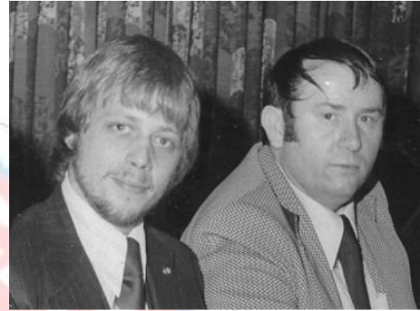
Grandmaster E.A. Fuzy