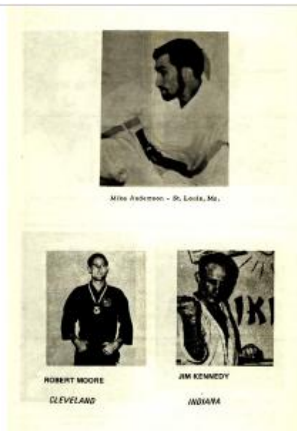
4th Midwest Karate Championships - Peoria, IL - September 18, 1971